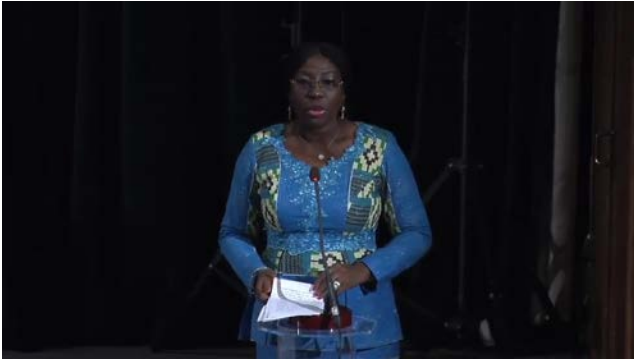
Ms Kandia Camara Minister of National Education of Côte d'Ivoire In her speech at the conclusion of the conference

Her address was directly related to the theme of the conference, the contribution of guidance for greater equity in education and in promoting and effect transition from education to working life..