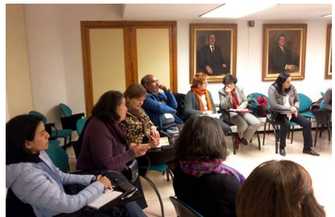
One of the pre-symposium working groups in Spanish

a critical mass to support the advancement of career development in our countries and regions