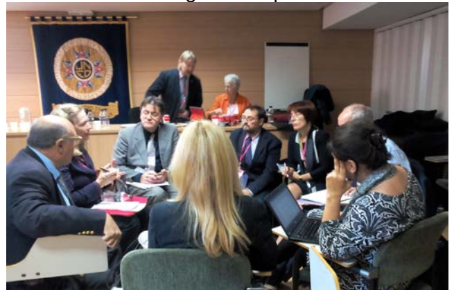
One of the pre-symposium Working groups In English

The symposium promoted one of IAEVG's major missions: to facilitate and improve communication among members and organizations in the field of educational and vocational guidance, but also to encourage the development of ideas, practices and research and collect and disseminate information on the latest research and guidance practices.