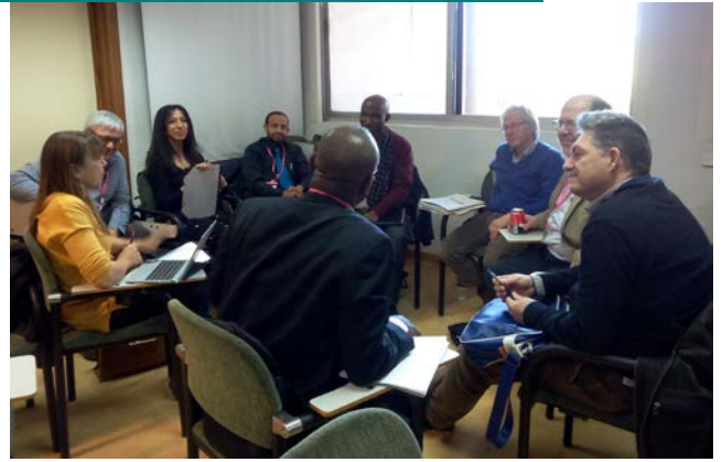
One of the pre-symposium Working groups in French

A Global pre-symposium brought together representatives of national and regional associations and organizations that were mostly IAEVG members.