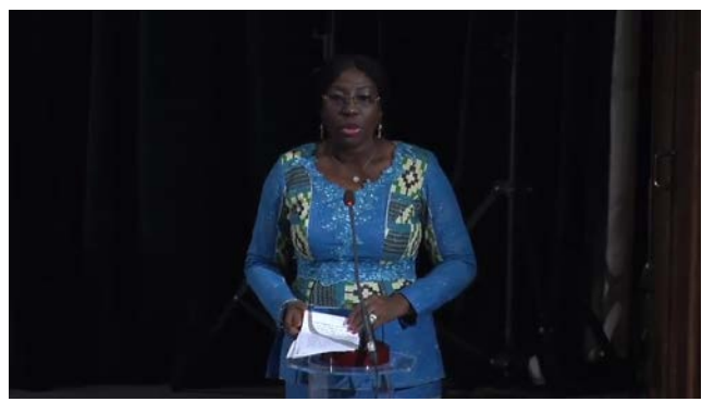
Ms Kandia Camara Minister of National Education of Côte d'Ivoire In her speech at the conclusion of the conference

Her address was directly related to the theme of the conference, the contribution of guidance for greater equity in education and in promoting and effect transition from education to working life..