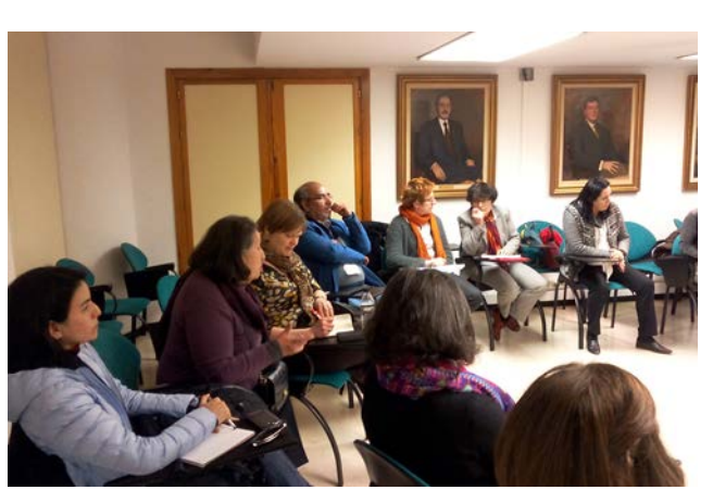
One of the pre-symposium working groups in Spanish

a critical mass to support the advancement of career development in our countries and regions