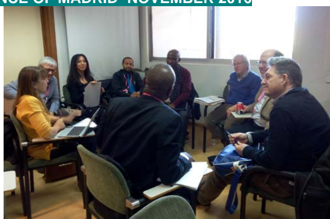
One of the pre-symposium Working groups in French

A Global pre-symposium brought together representatives of national and regional associations and organizations that were mostly IAEVG members.