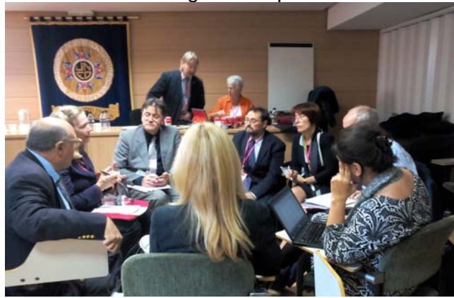
One of the pre-symposium Working groups In English

The symposium promoted one of IAEVG's major missions: to facilitate and improve communication among members and organizations in the field of educational and vocational guidance, but also to encourage the development of ideas, practices and research and collect and disseminate information on the latest research and guidance practices.